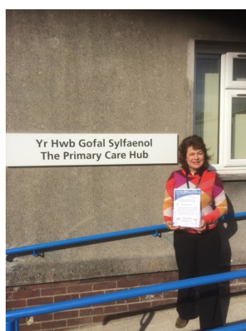
Neath Port Talbot Carers Centre Health Liaison Worker

Neath Port Talbot Carers Service also have contact with the primary care practices in their area and have conducted outreach sessions in 13 centres. The Health Liaison Worker attended all Flu Clinics in the area provides updates to all Practice Managers and updates surgery and practice noticeboards quarterly. This is funded from Integrated Care Fund 2018 -19.