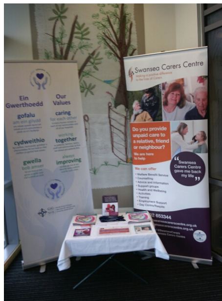
Information stands at Cefn Coed Hospital

The work at Bridgend and Neath Port Talbot Hospitals is funded from the Integrated Care Fund 2018-19. The work undertaken in Swansea Hospitals is funded from a range of sources including Welsh Government Carers Funding for 2018-19 and Integrated Care Fund 2018-19 for work with carers and families on paediatric wards.